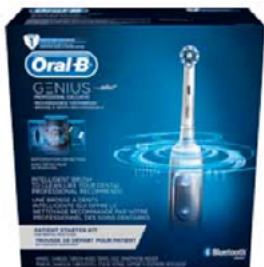
Oral-B® GENIUS™ Professional Exclusive Power Toothbrush