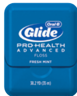
Oral-B® Glide™ PRO-HEALTH™ Advanced Floss