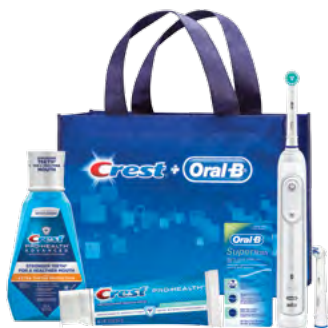
Crest® + Oral-B® Ortho Essentials System*